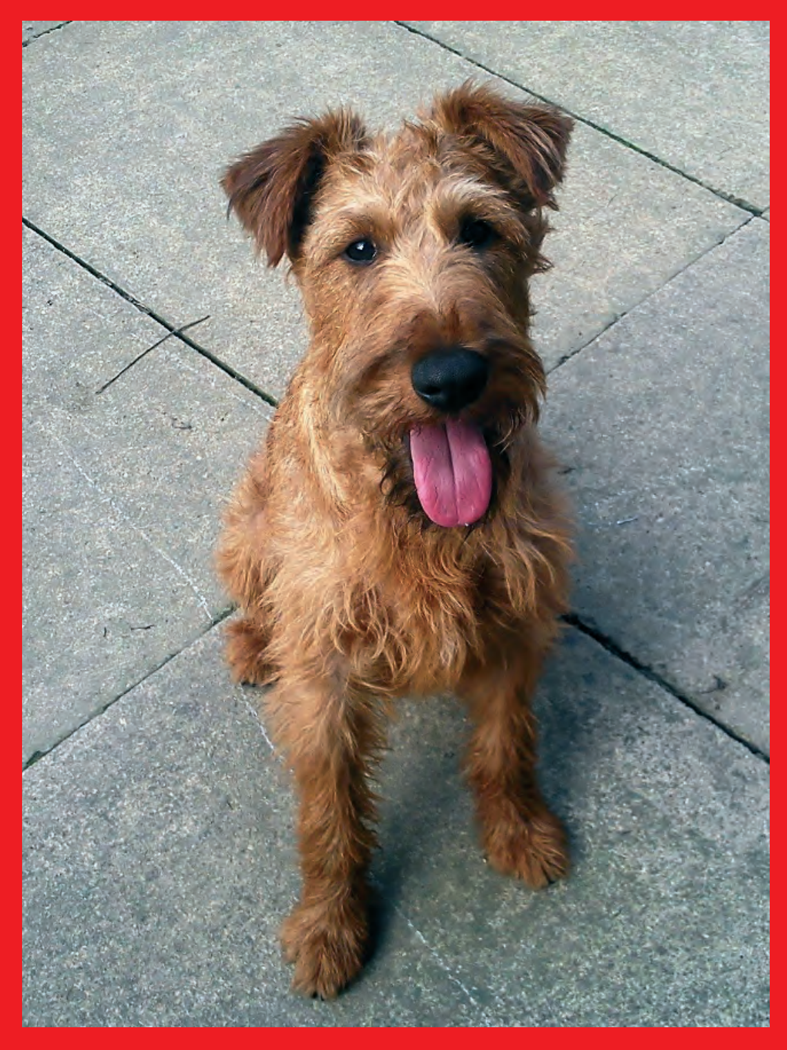
Padraig an Madra (Paddy the Dog) wishes you a Happy New Year!