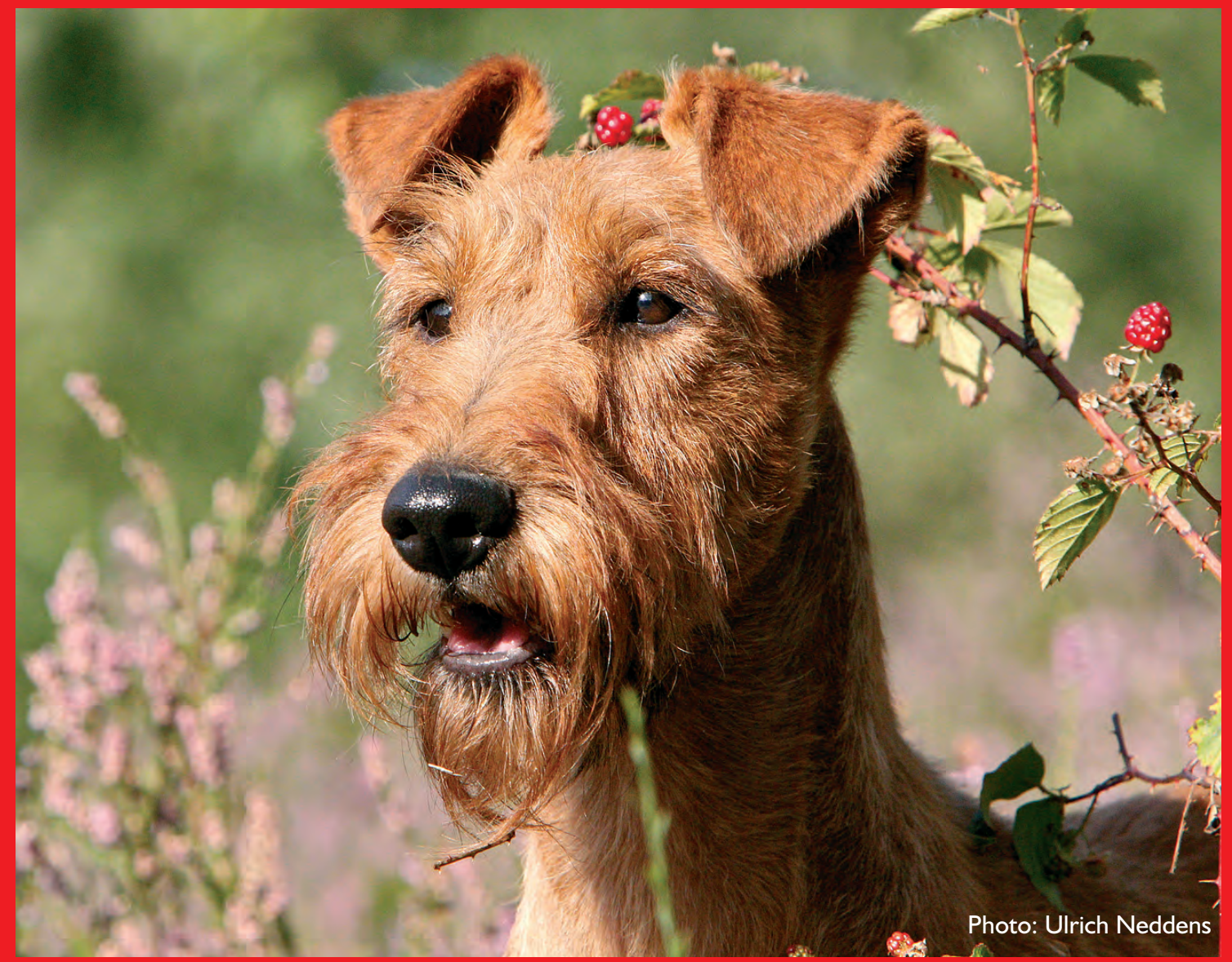
This is a beautiful study of an Irish terrier. It is Horatio (Von der Emsmuhle) and seems to capture their quintessential character, alert, amused, watchful, ready for off yet warm as the sunshine . . . and of course, has that irresistible twinkle which captivates us all. It seems he refused to be photographed sitting down until they'd swept away the brambles.