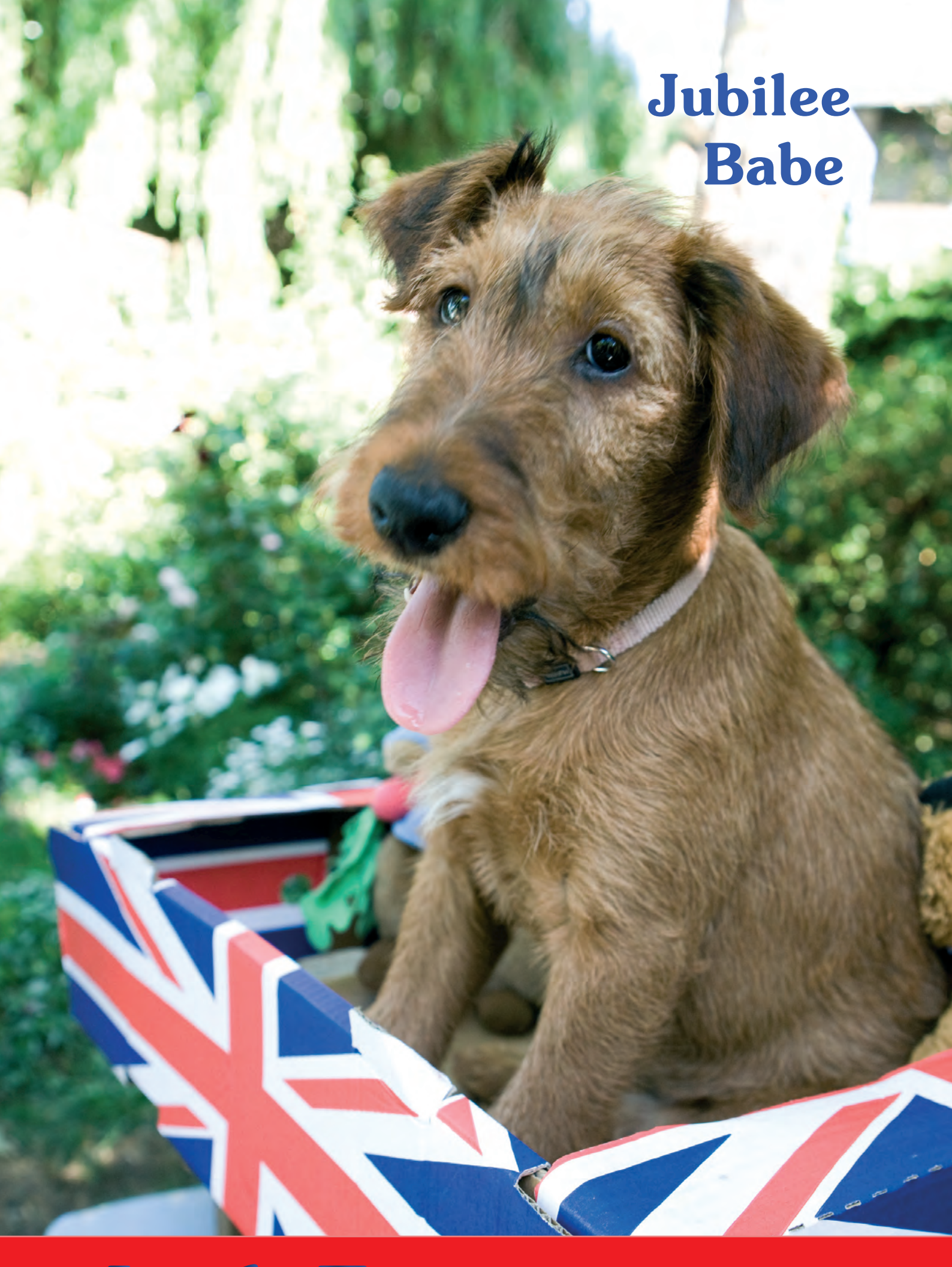
Irish Terriers 2012