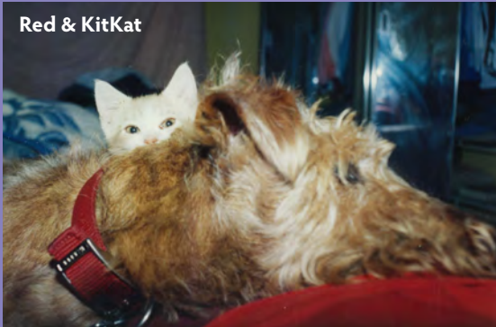
Red & KitKat